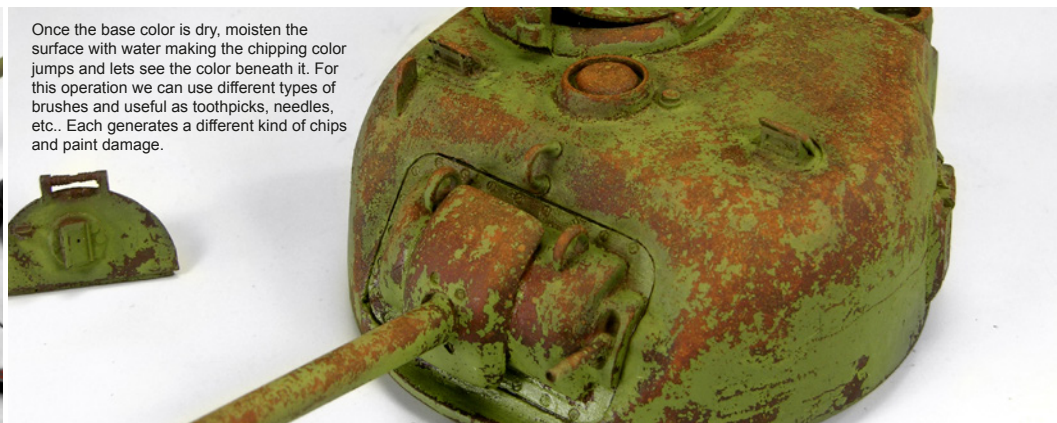
Once the base color is dry, moisten the surface with water making the chipping color jumps and lets see the color beneath it. For this operation we can use different types of brushes and useful as toothpicks, needles, etc.. Each generates a different kind of chips and paint damage.