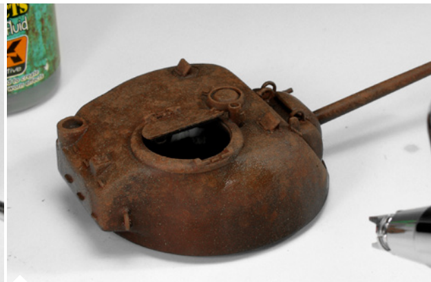
Airbrush the product directly from the jar. If needed, give a couple of coats allowing to dry between them. The product dries in very few minutes.