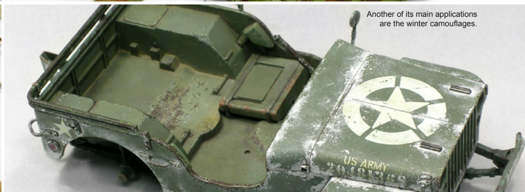
Another of its main applications are the winter camouflages.