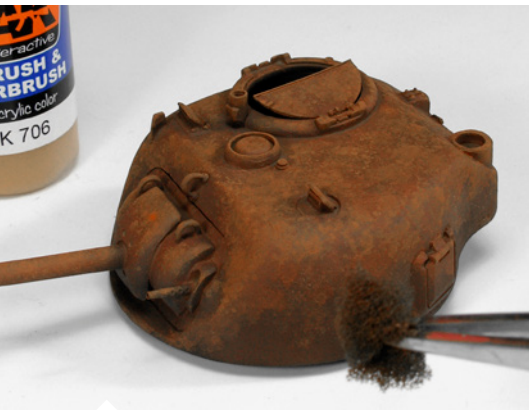
With lighter rust colors and a small piece of foam apply the paint to create a dots to generate some texture.