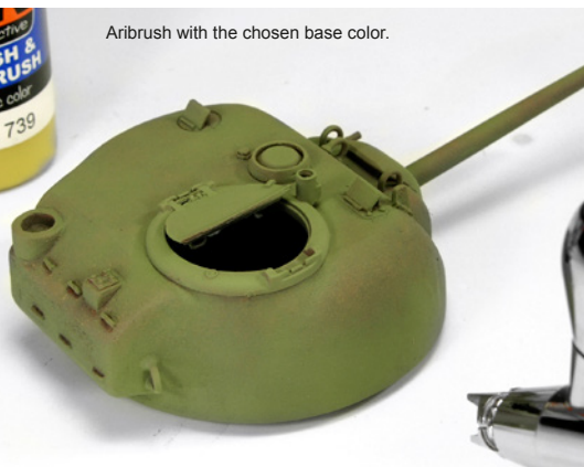
Airbrush with the chosen base color.