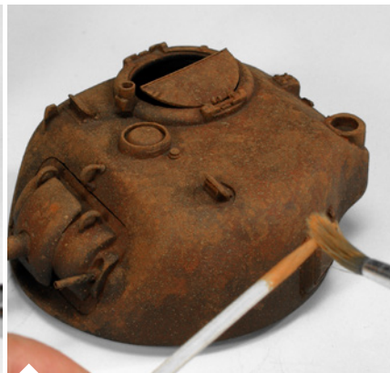
We add some more dots with the lighter rust color of the set and stick technique.